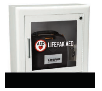
Surface Mount (7" Return)

AED Wall Cabinet with Alarm 11220-000079 (White) 11220-000076 (Stainless)