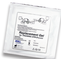
Replacement Adhesive Gels for CPR-D-padz Trainer Electrodes Part# 8900-0803-01

(Replacements must be ordered separately)