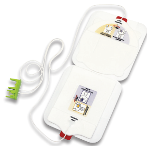
Stat-padz® II Trainer Electrodes Part# 8900-0805-01 (case of 6)