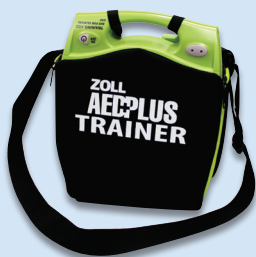
AED Plus Trainer Carry Case Part# 8000-0375-01