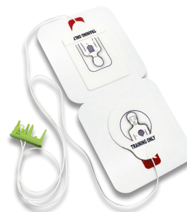
Pedi-padz® II Trainer Electrodes Part# 8900-000861-01 (case of 6)