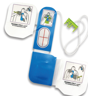
CPR-D-padz Trainer Electrodes Part# 8900-0804-01