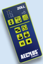
AED Plus Trainer2 Replacement Remote Part# 8008-0007