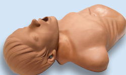
AED Plus Trainer Demo Manikin Part# 8000-0835-01